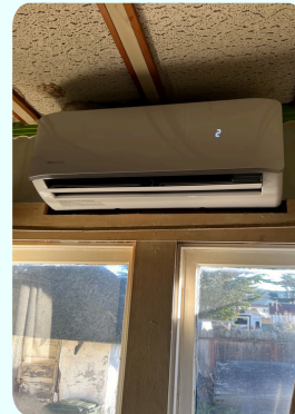
Kim Residence with Upgraded Induction Range and Ductless Mini Split