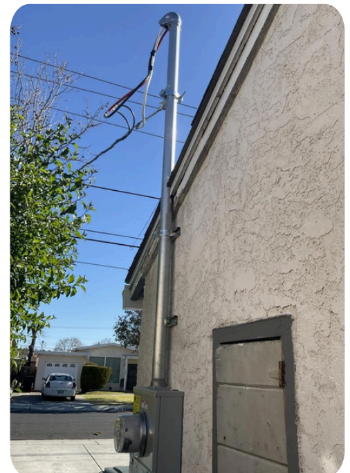
Figure 2: Upgrading Utility Service Capacity is Expensive and Time Consuming

National and State electrical codes offer several methods for calculating the existing and planned electrical loads. The calculated electrical loads aid in determining if the existing electrical infrastructure (in front of and behind the meter) will be adequate for the planned improvements. Every project is unique and requires accurate assessments and calculations to identify needed electrical improvements. References here are provided for informational purposes only. A qualified electrical professional must evaluate each project individually.