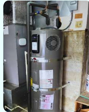
Davis Residence with Upgraded Circuit Splitter and HPWH