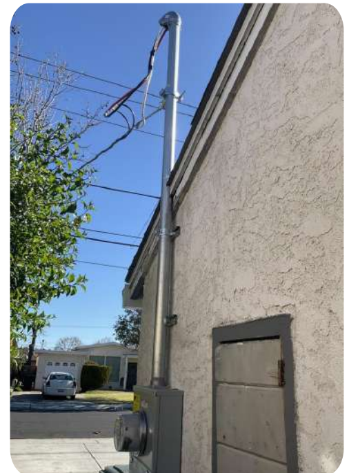
Figure 2: Upgrading Utility Service Capacity is Expensive and Time Consuming

National and State electrical codes offer several methods for calculating the existing and planned electrical loads. The calculated electrical loads aid in determining if the existing electrical infrastructure (in front of and behind the meter) will be adequate for the planned improvements. Every project is unique and requires accurate assessments and calculations to identify needed electrical improvements. References here are provided for informational purposes only. A qualified electrical professional must evaluate each project individually.