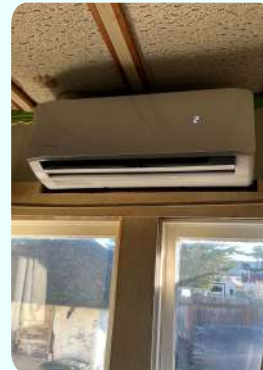
Kim Residence with Upgraded Induction Range and Ductless Mini Split