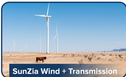
SunZia Wind + Transmission