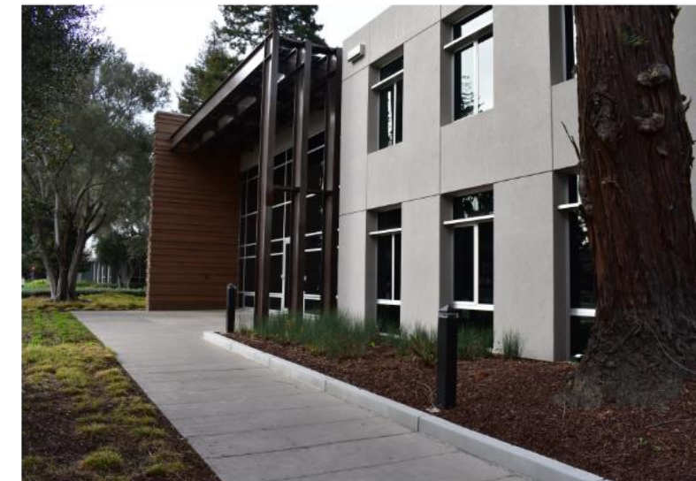
2019 Winner, 380 Mathilda Avenue